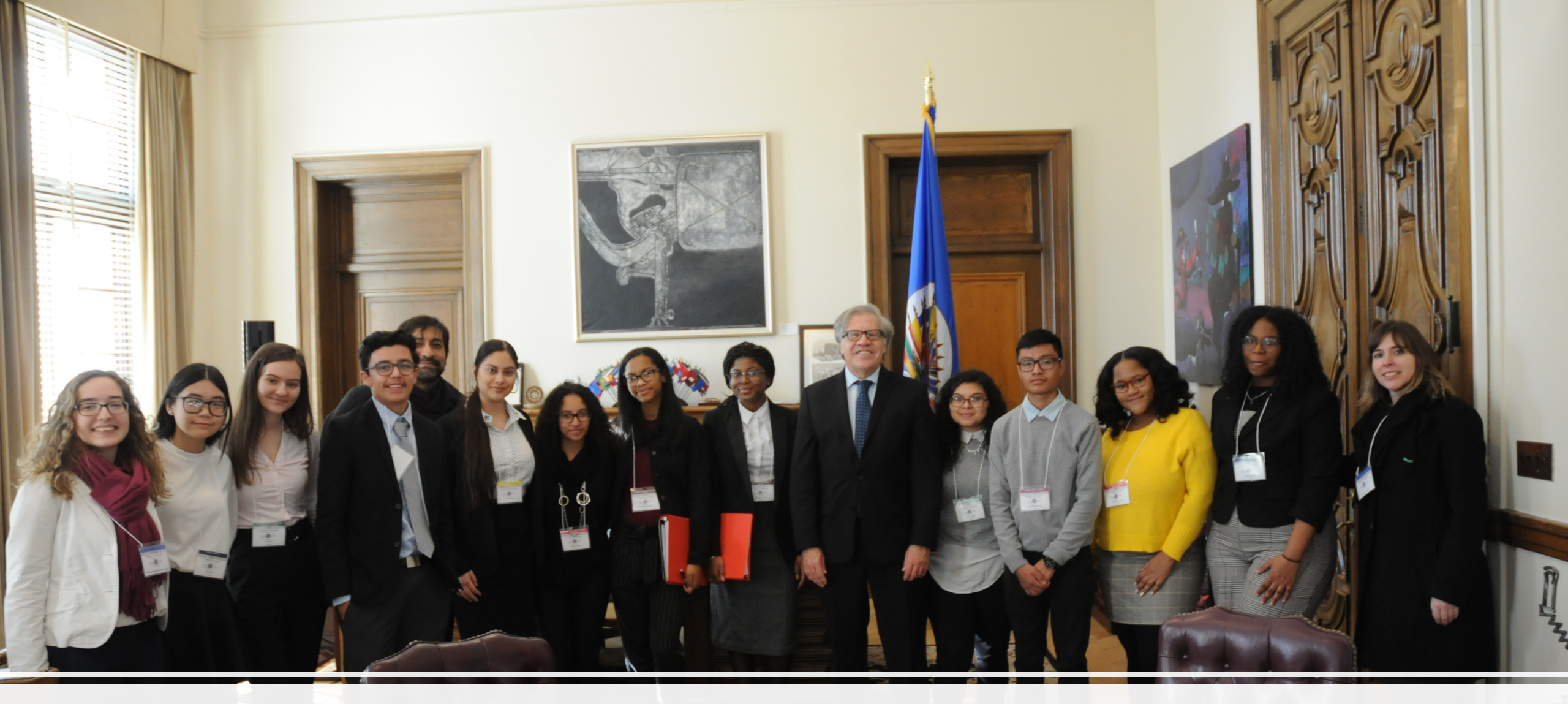
¡Gracias! Obrigado! Thank you!